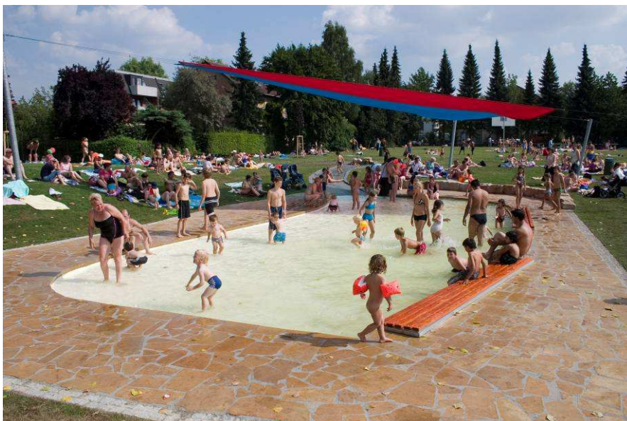
Photo: Paddling pool

The water treatment plant is dimensioned for an average number of 1,186 swimmers. It works without any chlorine/chlorine dioxide.