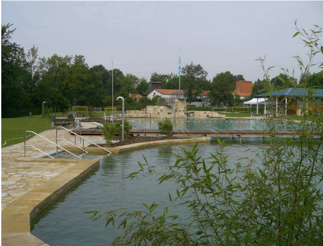
Photo: Swimmers' and non-swimmers' pools

Redevelopment and conversion to outdoor natural pools, construction of a constructed wetland (reed), modification of the entrance and parking area