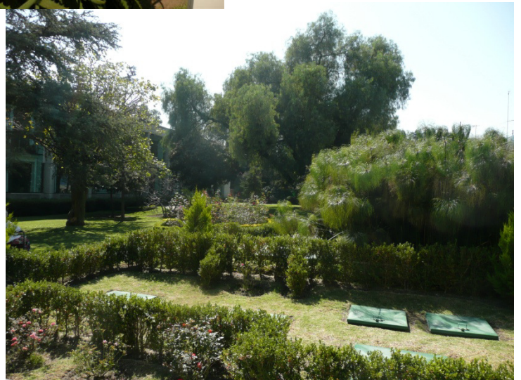
Hygienisation filter (vertical subsurface flow constructed wetland) in 2011