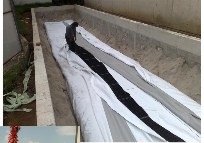
Underground storage boxes