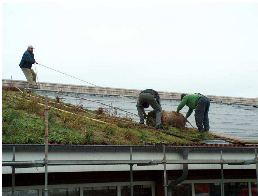
Installation of the plant mats

The selected types of wetland or marsh plants will be pre-cultivated on mats of non-woven material for one year before becoming part of a wetland roof structure. For the cultivation, textile base mats for plants are used with a considerable water accumulating capacity ensuring at the same time a mechanical protection for the roof skin. After approximately four months, they will be completely penetrated by roots, and the mat strips are then ready to be installed on the roof.