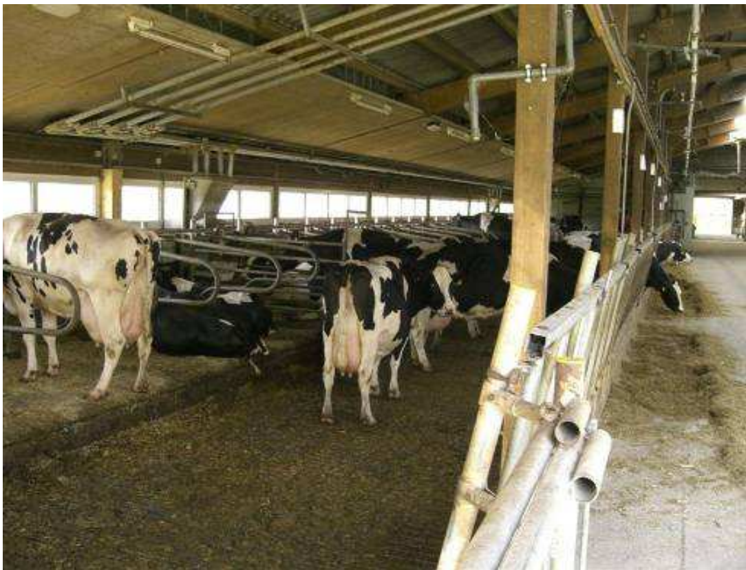
Water feeding pipes of the FAL cowshed in Brunswick (2006) The wetland roof (834 m 2 ) improves the climate within the cowshed and increases the milk yield because of the improved keeping conditions

Both the plants themselves and the microorganisms living on their roots remove nutrients from the water to be used for their growth and for their metabolism. Wetland roofs may not only be used for the retention and purification of stormwater, but also for domestic, agricultural and industrial waste water. The purified water may be reused for irrigation or for sanitary facilities (greywater recycling).