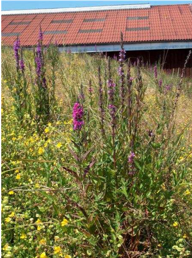
Purple loosestrife (Lythrum) and monkey flowers (Mimulus) on a wetland roof (2006)

A wetland roof is an energy saving air-conditioning system with numerous particular ecological functions which offer promising advantages especially for global centres of population like megacities, for example.