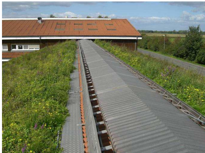
The FAL cowshed roof in Brunswick (2006)

Wetland roofs are natural air-conditioning systems. During the spring and summer months, the heat of the rooms below will be eliminated by the evaporation of the water. When it becomes colder in autumn or winter, a wetland roof is, due to its additional heat insulating effect, an excellent protection against an extensive heat loss.