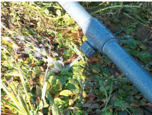
Outlet of the water feed system

A penetration of the roots into the roof and the resulting destruction of the roof skin is prevented by a substructure consisting of a root barrier layer and non-woven material (textile). Since wetland or marsh plants need a certain degree of humidity, an artificial irrigation system adaptable to the season will be necessary for which a water distribution pipeline network with several outlets with exactly defined distances between them will be installed on the ridge of the roof.