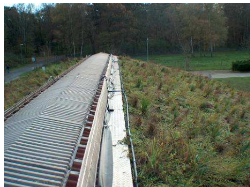
Irrigation along the ridge